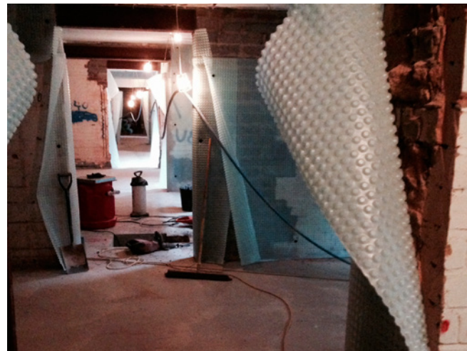
Platon P8 being fitted around interior doorways