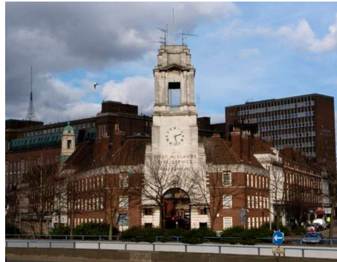
Lancaster Circus in Birmingham