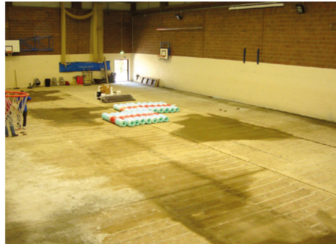
The failed system resulted in severe water ingress at wall/floor and floor/floor junctions.

Following installation of the new system, the membrane was screeded over and a wooden sports floor reinstated.