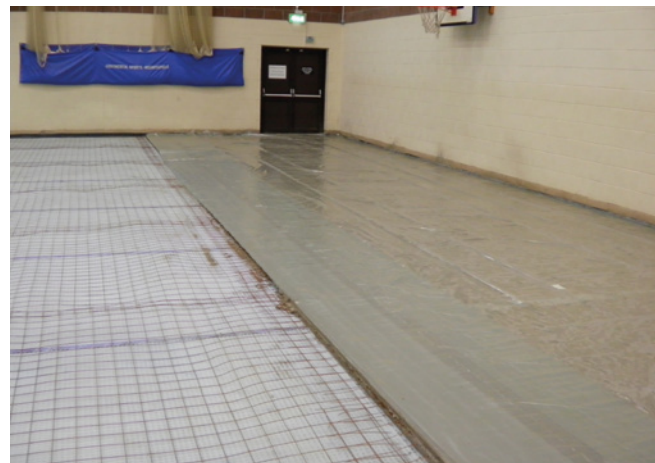
Cavity drain membranes can be screeded over. A new sports floor was then installed to complete the refurbishment.