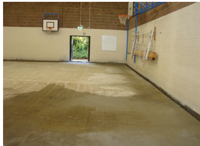
A channel was cut to the perimeter to house the Aqua Channel drainage conduit.