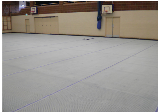
Platon P8 was loose laid to the floor with minimal preparation required to the existing slab.