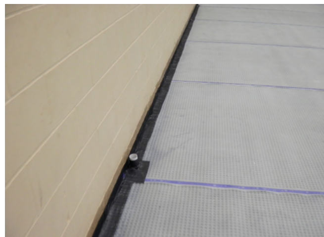
Rodding eyes were set at 10 metre intervals.