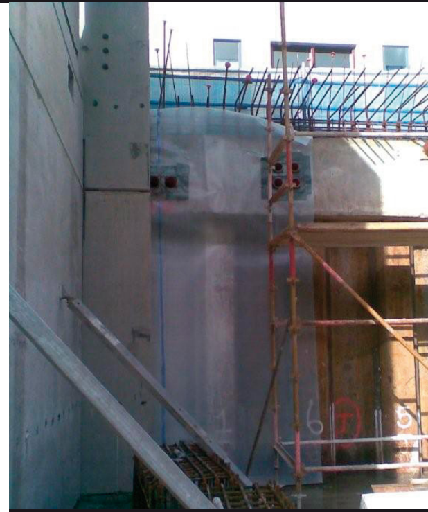
Platon Multi was first fixed to the sheet piling walls

Sheet piling supplied by Sheet Piling UK Tel 01772 79 41 41 www.sheetpilinguk.com