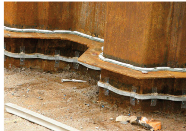
Triton's TT Waterstop and TT Swellmastic to construction joint detailing

The depth of the basement, the high water table and the close proximity of the River Lee (10 metres away) led to a combination of waterproofing systems being specified in view of the intended use of the structure (retail and office space). The combination system (as defined by BS 8102: 2009) comprised a structurally integral type B system (welded sheet piling) on the walls; a drained type C system to walls and floors (a complete internal cavity drain membrane system); and a barrier type A membrane beneath the floor slab.