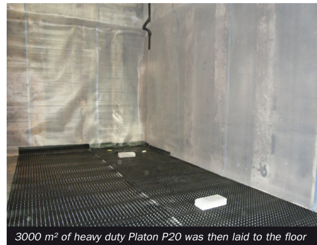
3000 m 2 of heavy duty Platon P20 was then laid to the floor