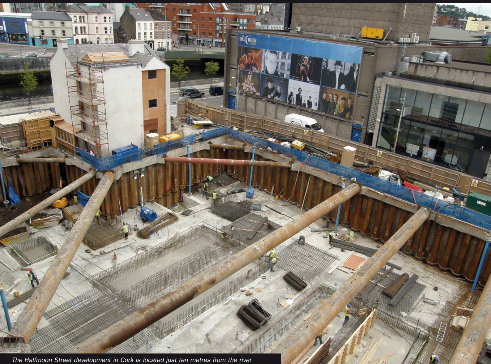
The Halfmoon Street development in Cork is located just ten metres from the river

Platon Multi (210 M), TT Vapour Membrane, Platon P20 Membrane (3000 M 2 )